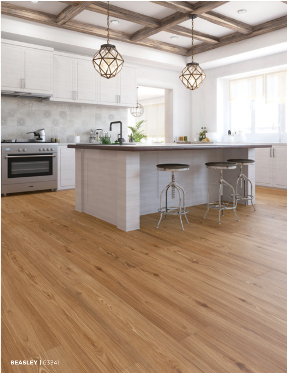
BEASLEY | 63341