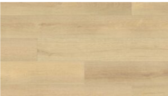
Blonde Montreux Oak