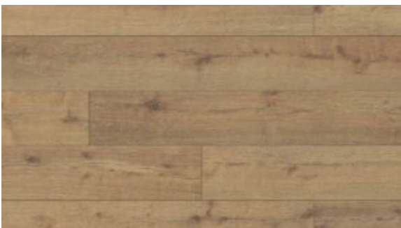
Sepia Tegernsee Oak