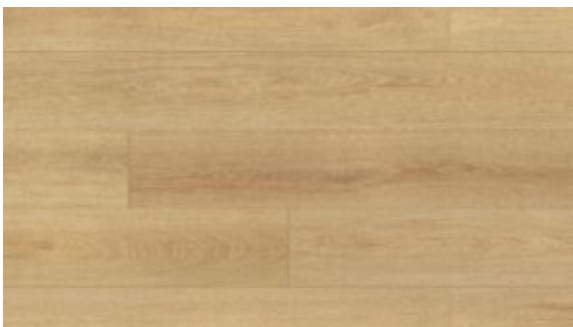
Farrow Montreux Oak