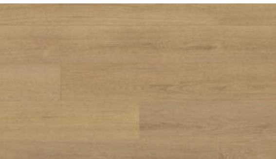
Natura Montreux Oak