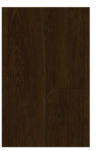
1373 Natural Wenge