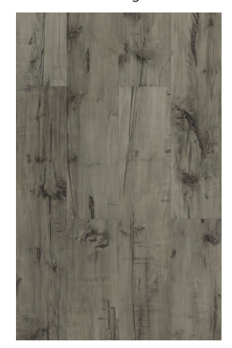
1363 Grey Hickory