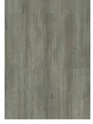
1362 Feathered Oak