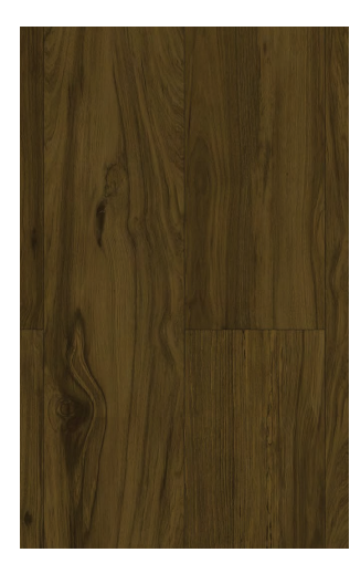
1372 Coastal Oak