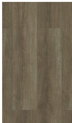
1380 Classic Oak