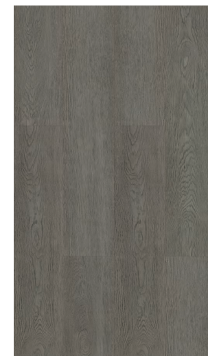
1384 Treasure Oak