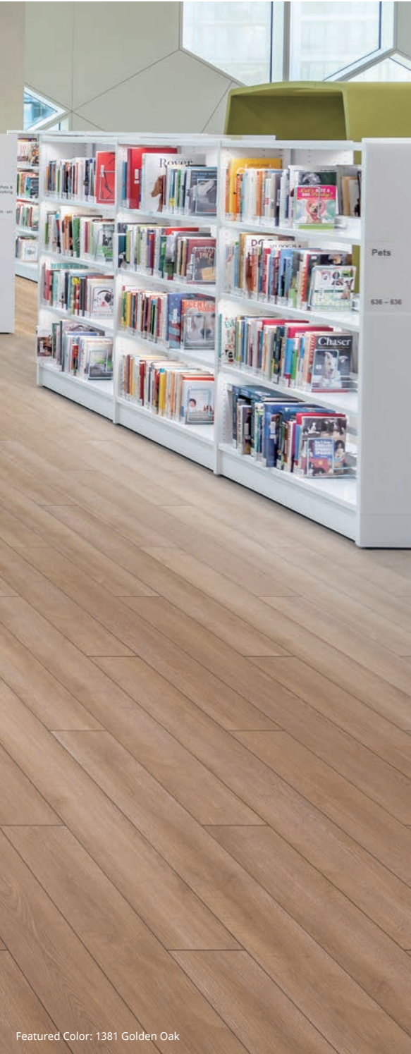
Featured Color: 1381 Golden Oak