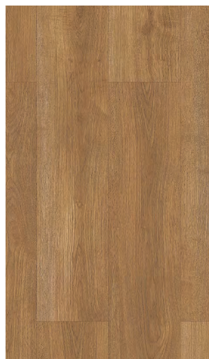
1381 Golden Oak