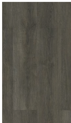
1382 Camelon Oak