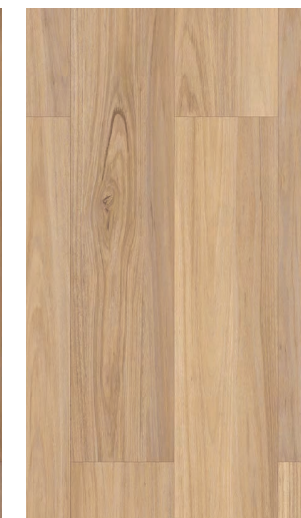
1387 Beige Oak