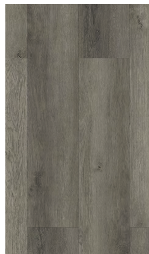
1383 Grey Oak