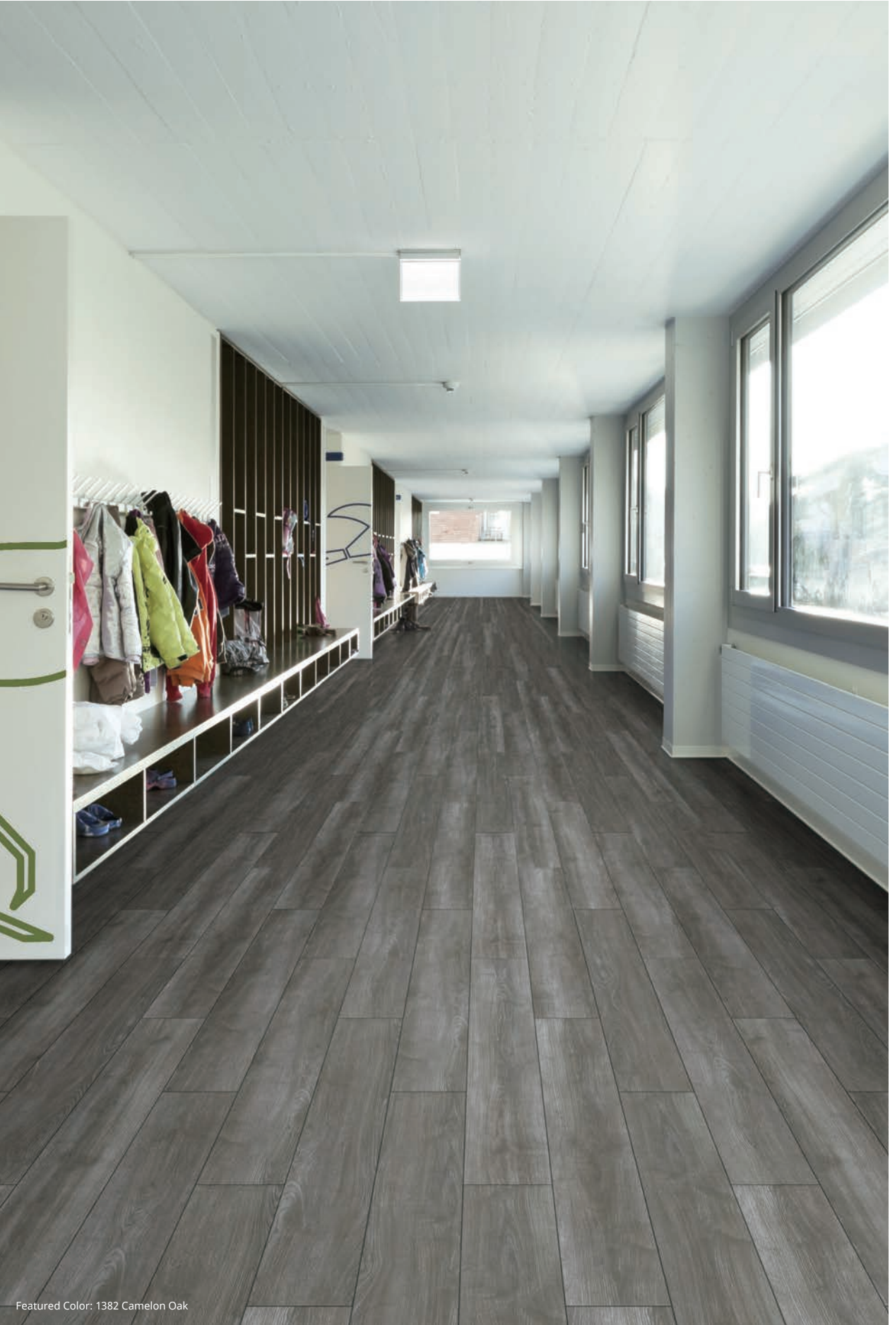
Featured Color: 1382 Camelon Oak