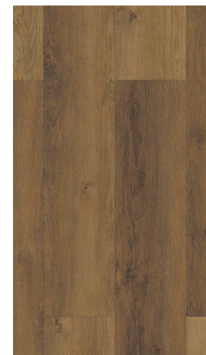
1385 Brown Oak