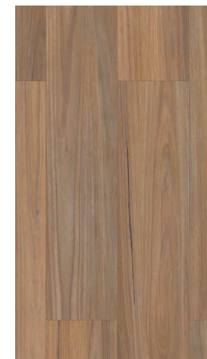
1386 Tasmanian Oak