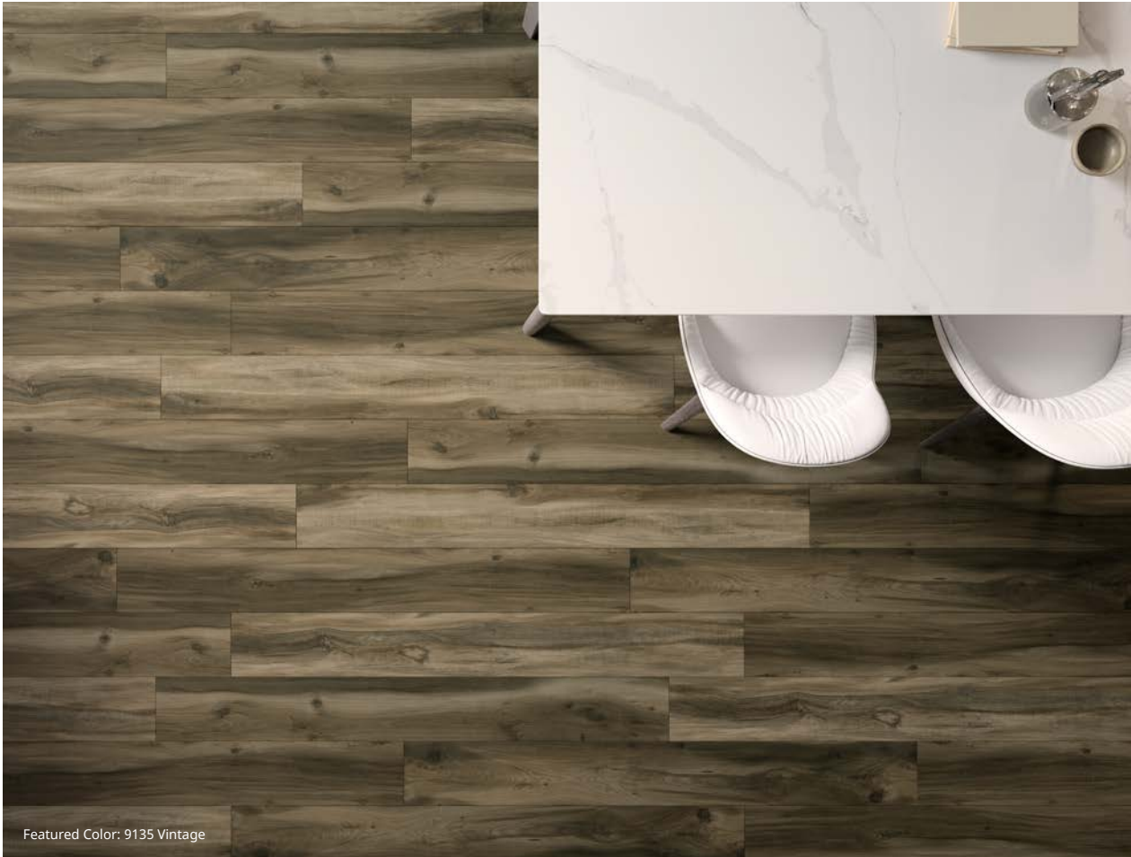
Featured Color: 9135 Vintage