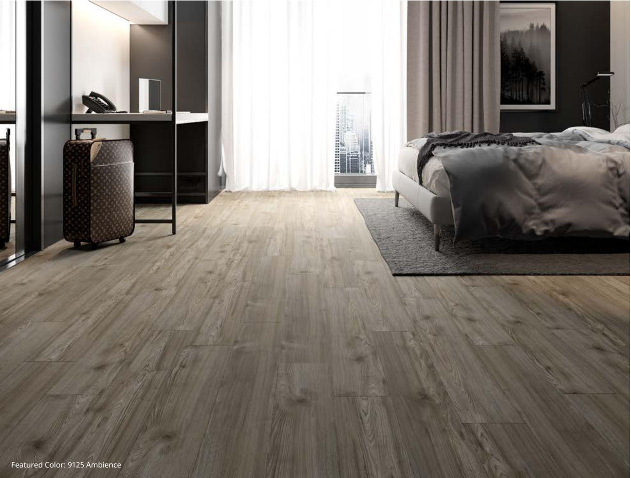
Featured Color: 9125 Ambience