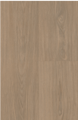
7982 | Natural Hickory

PRESTG XL offers a blank canvas for creativity. With exceptional durability, easy installation, water and wear resistance, noise reduction, and a universal wood color palette, PRESTG XL helps you create a serene and balanced environment for modern living.