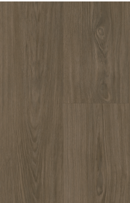
7983 | Timbered Hickory