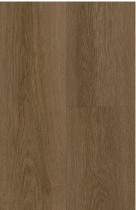
7987 | Chocolate Oak