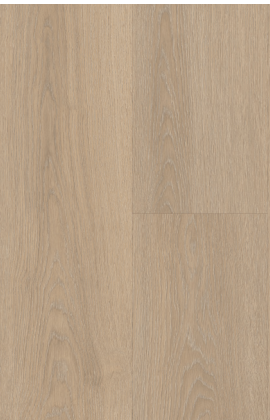
7984 | Vanilla Oak