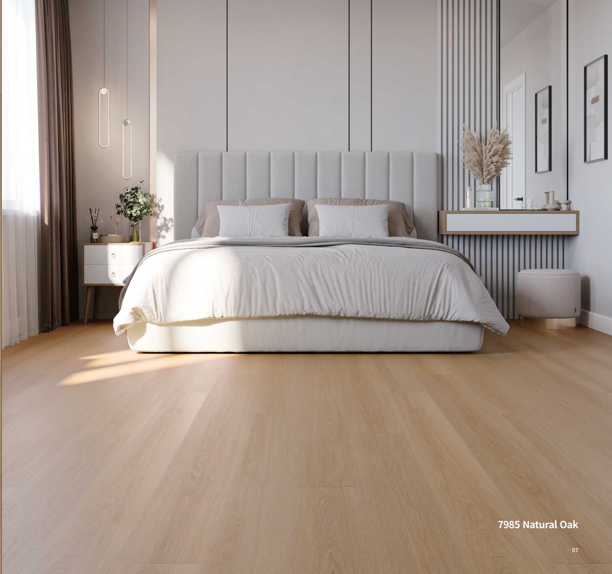
7985 Natural Oak