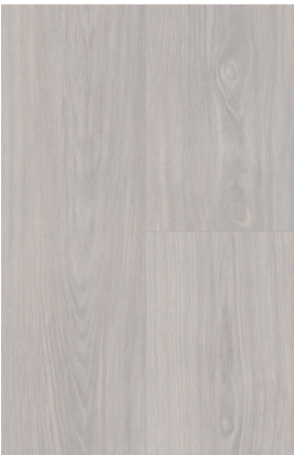
7981 | Nordic Hickory