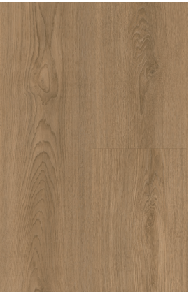
7991 | Wheat Oak