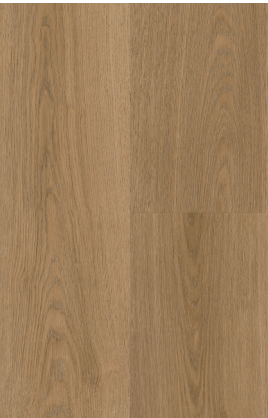
7986 | Blonde Oak