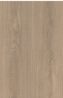
7990 | European Oak