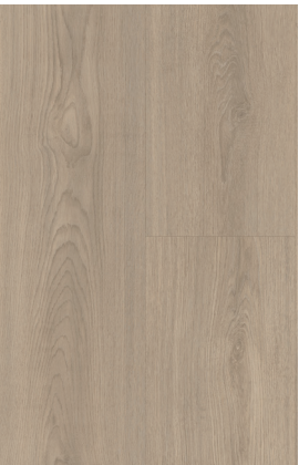
7989 | Weathered Oak