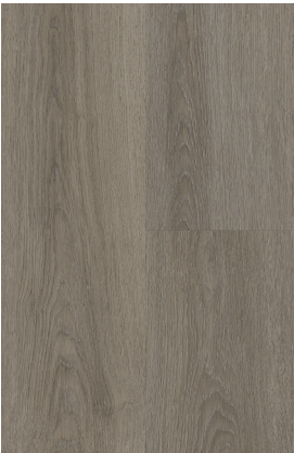
7988 | Stone Mountain Oak